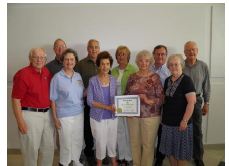
Governor's Volunteer Award for Highway Clean-up - 2013