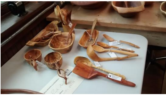
Richard's chip carvings